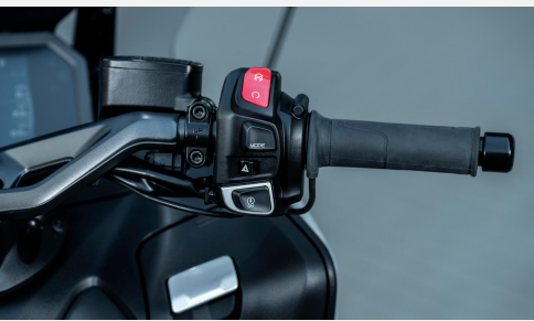
Heated grips and heated seat

any Yamaha Sport Scooter, the TMAX Tech MAX is equipped to provide you with a luxurious ride all year round. Giving 110mm of movement, the electrically adjustable screen enables you to choose the ideal position to suit your physique and riding style.