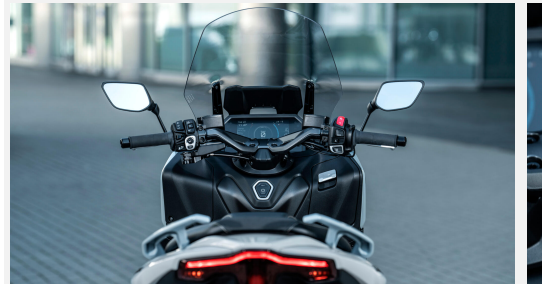
Electrically adjustable screen

any Yamaha Sport Scooter, the TMAX Tech MAX is equipped to provide you with a luxurious ride all year round. Giving 110mm of movement, the electrically adjustable screen enables you to choose the ideal position to suit your physique and riding style.